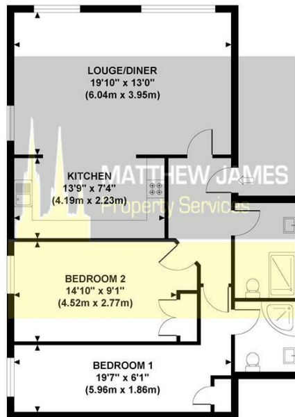
GROUND FLOOR GROSS INTERNAL FLOOR AREA 814 SQ FT

Although every attempt has been made to ensure accuracy, all measurements are approximate and no responsibility is taken for any error, omission, or mid-statement. This floor plan is for illustrative purposes only and not to scale. Measured in accordance to RICS standards.